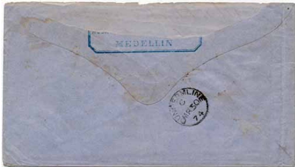
1 2 March 1874, Cover sent unpaid, British Post Office circular Datestamp SAVANILLA "A" MR 74, on arrival at Plymouth, received the Handstamp 1/- One Shilling to pay. DUNFERMLINE cds "C" / MR 30 / 74. RMSPC Elbe left Savanilla 4 March arrived Colon 5 March and arrived at Plymouth 29 March 1874. (Part top flap missing - MEDELLIN Senders Imprint - part)