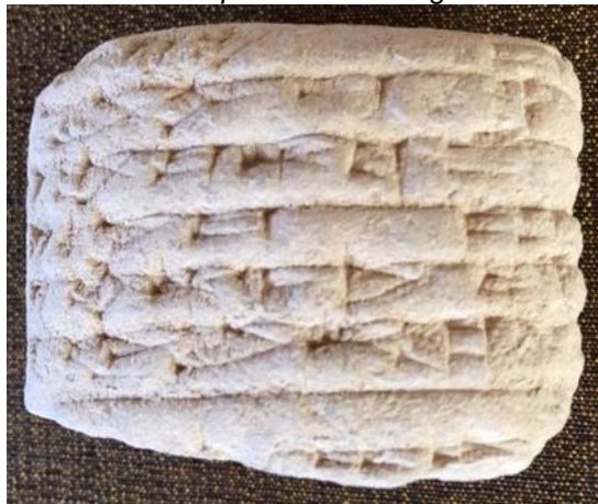
Clay Tablet in Author's collection

Provenance – Lot 237 Christie's-Robson Lowe Auction 24 November 1987.