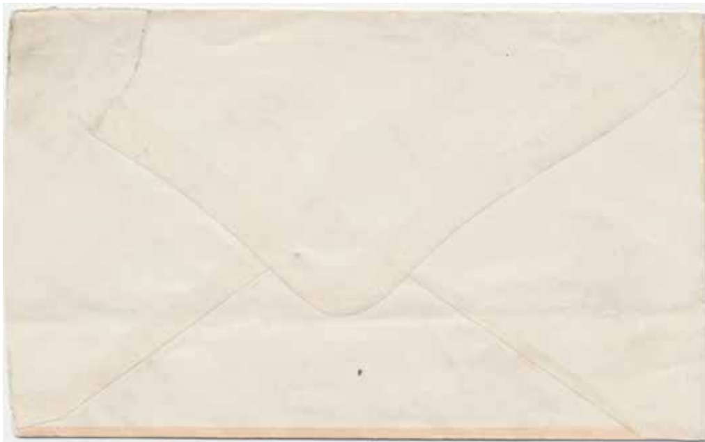
No Postal Markings