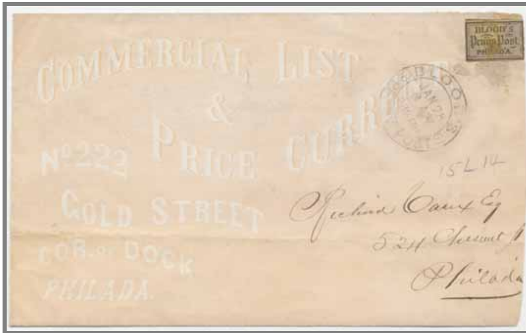
28 January - BLOOD'S Penny Post PHILAD'A 1c Bronze on Lilac, cancelled with acid