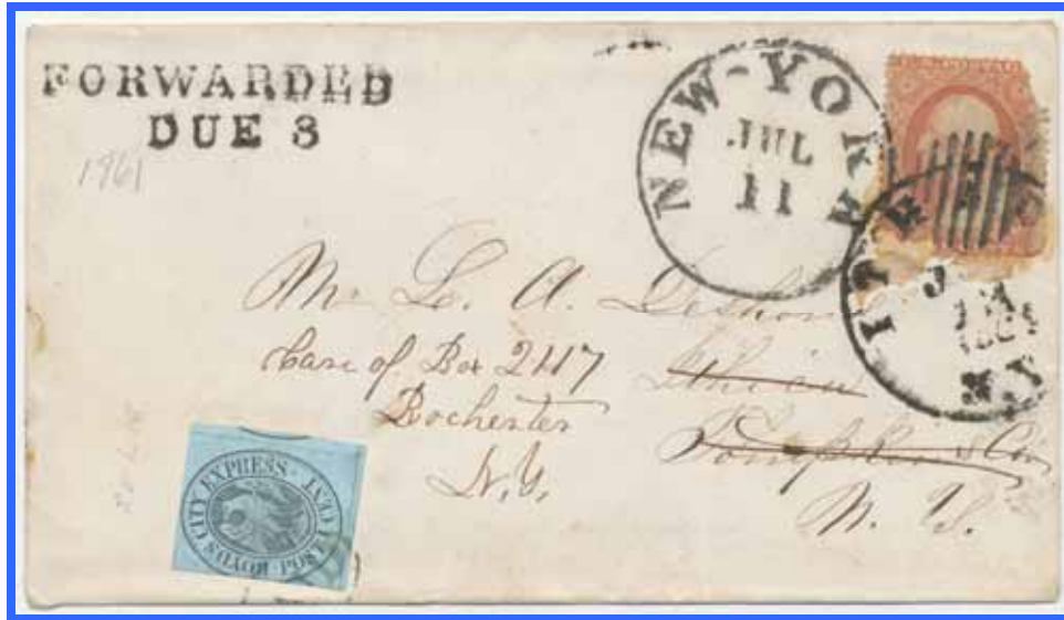
1861 - New York BOYD'S CITY EXPRESS POST 1860 1 Cent Blue- Grey Readdressed - Handstruck "FORWARDED DUE 8 (Cents)"