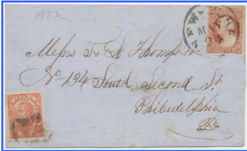
1852 Swart's City Dispatch (1849 2cent Red) New York to Philadelphia