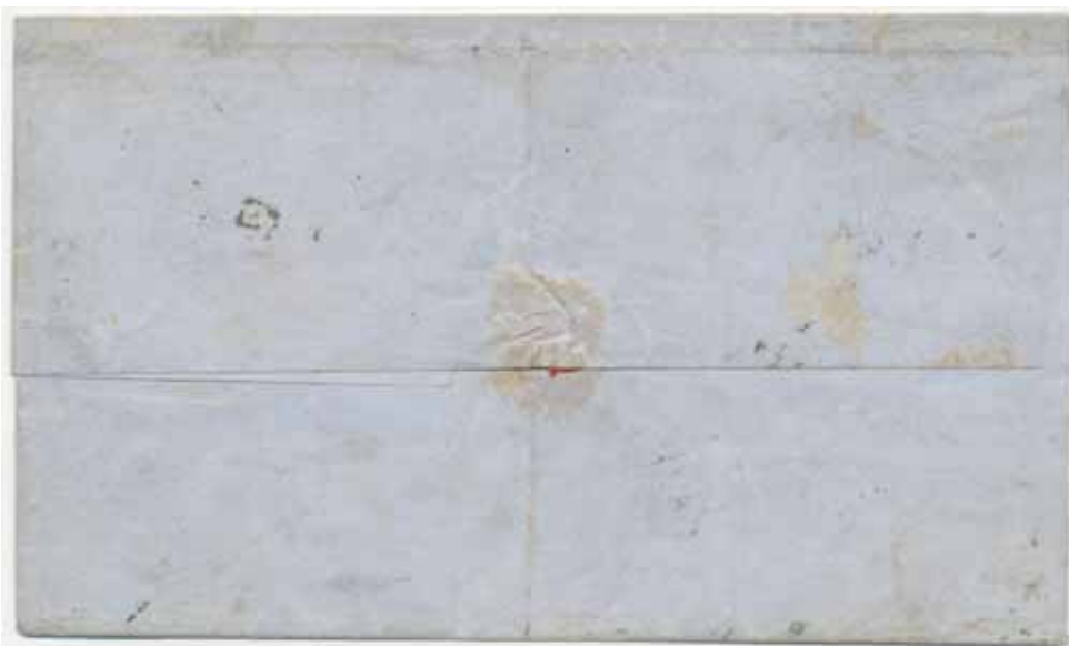
Outer Wrapper originally contained a Bill of Lading 22 May 1852