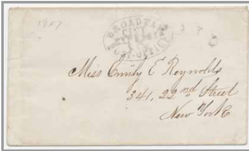
1857 New York BROADWAY Post Office City Express PAID