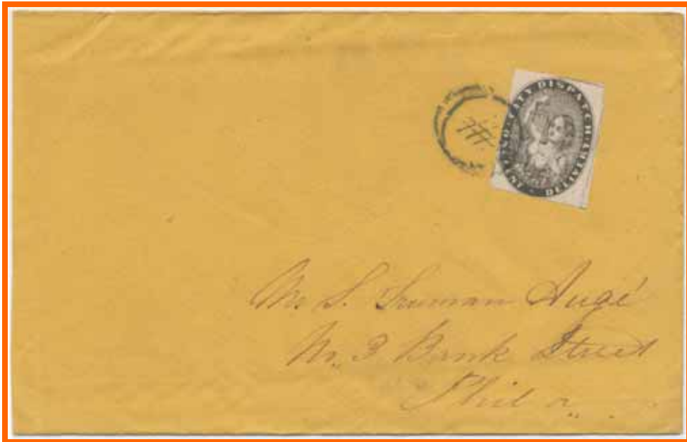
1860 One Cent CITY DISPATCH – DELIVERY Adhesive Black – (Stone 1)