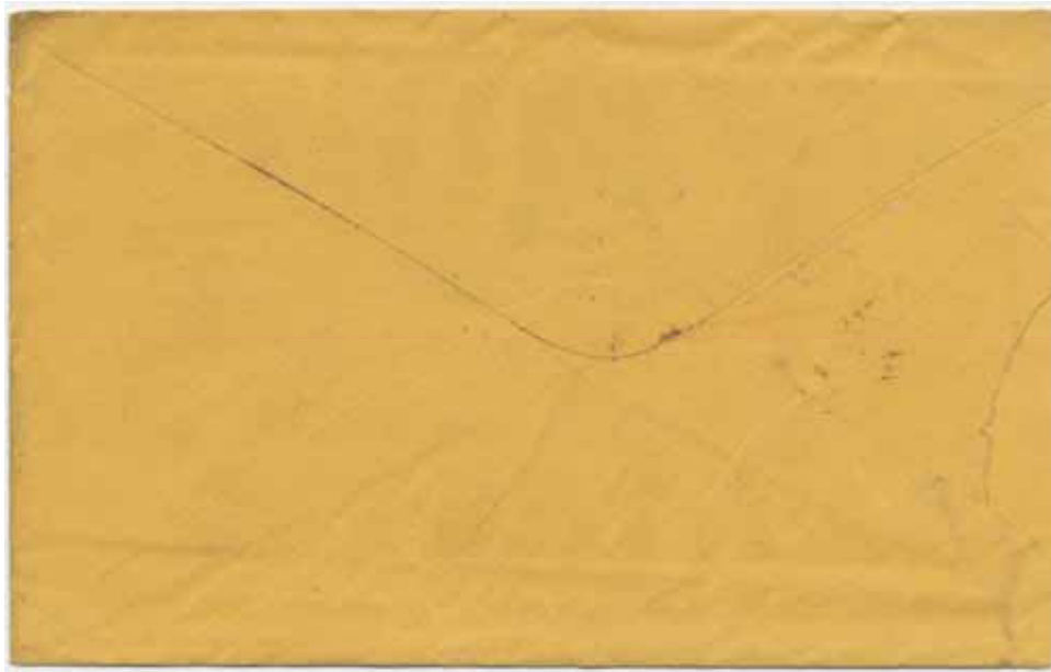
No Postal Markings – Complete with Entire Letter – Undated.