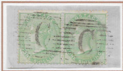
The bars of the "C" obliterator just extends on to the cover thus being "Tied"

It is very important when collecting envelopes (covers) that the postage stamps are tied. In other words; the cancellation on the postage stamp should overlap on to the cover. Most International Judges now insist that if the cancellation is only on the postage stamp, then a certificate of authenticity from an Expert will be required