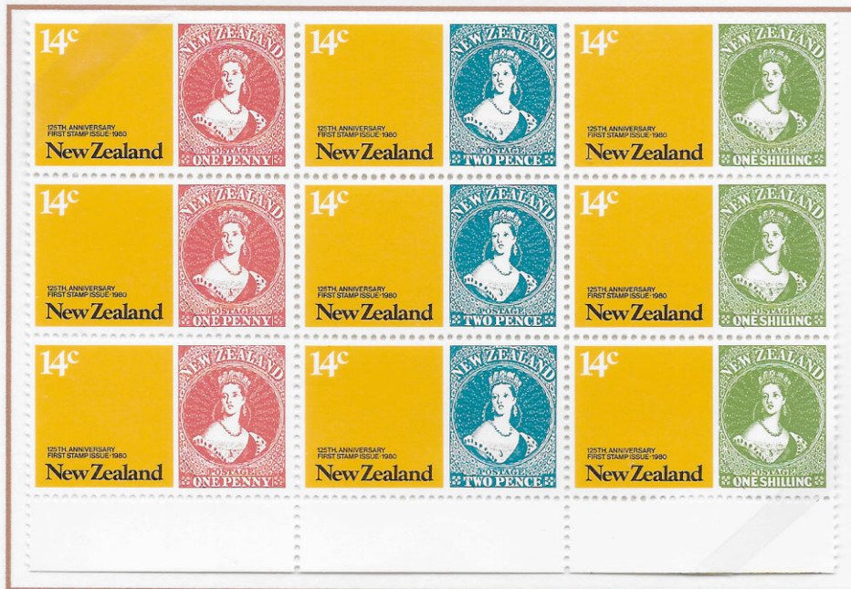
Normal issue - Rows 8, 9 & 10 Stamps 7, 8, & 9

Issued for the ZEAPEX INTERNATIONAL STAMP EXHIBITION