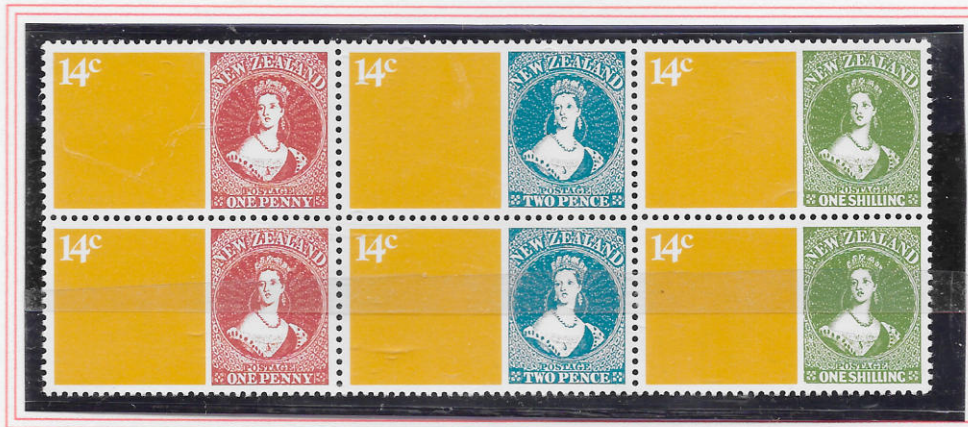
Missing Black - Rows 8 & 9, Stamps 7, 8, & 9

(NZ) 125th ANNIVERSARY POST STAMP ISSUE 1980