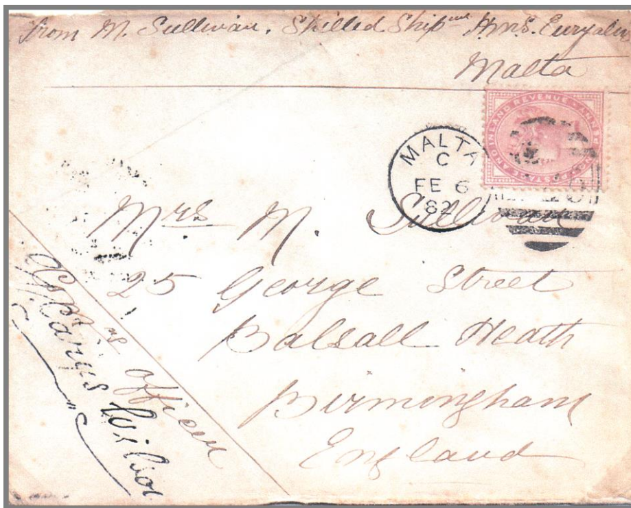
Figure 4 A