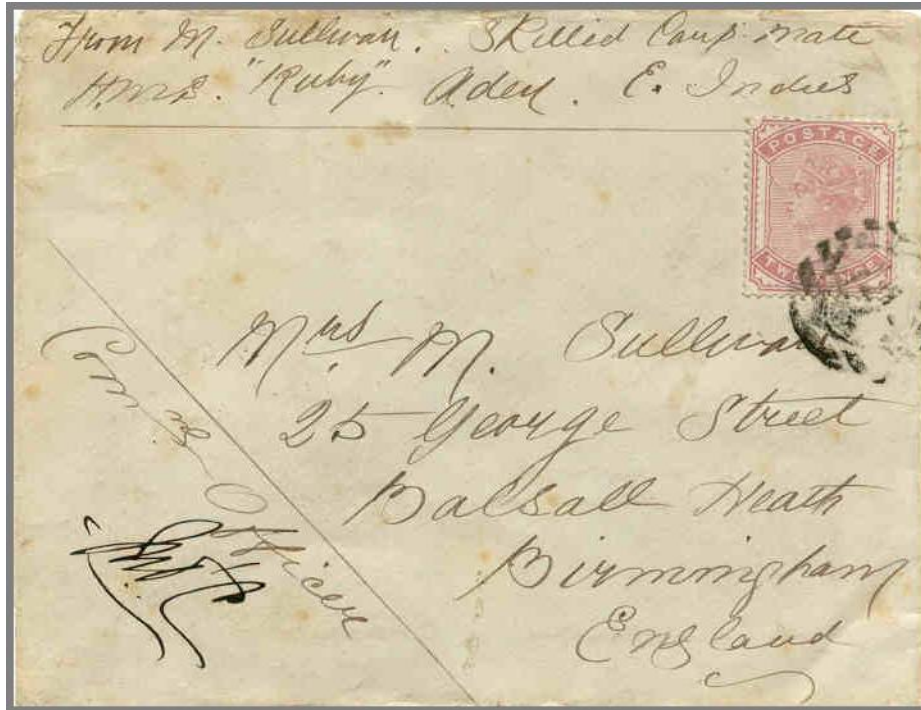
Figure 5A 1