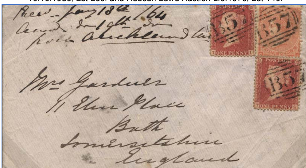
Auckland 6 November 1863 Circular date stamp Bath 18 January 1864

Provenance ex Oliver Bowlby collection, Robson Lowe Auction 10.10.1956, Lot 269. and Robson Lowe Auction 2.6.1978, Lot 140.