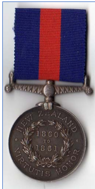
New Zealand Medal