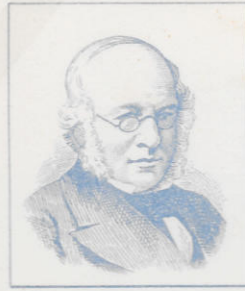
"HE GAVE US PENNY POSTAGE"