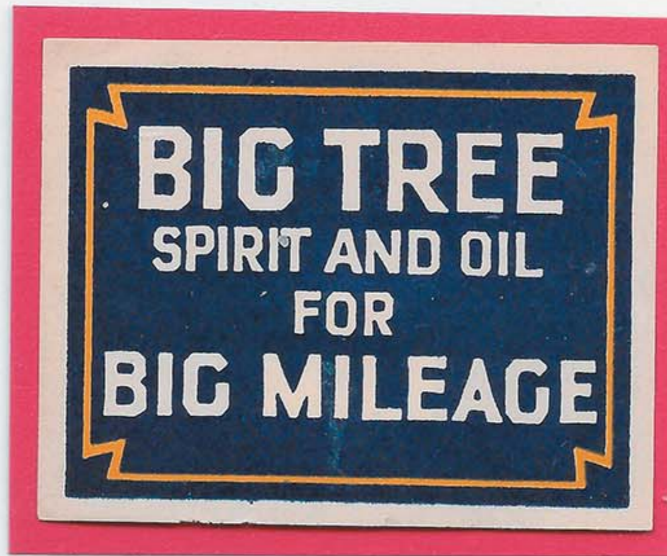
A. S. Paterson & Co. Ltd Advertising Label

This exhibit is an example of SOCIAL POSTAL HISTORY where popular pictorial postcards have been used to advertise the "BIG TREE" Petrol. This innovative campaign of different messages was based on the captions on the postcards, basically as a "Play on Words". Three types of PERMIT PAID stamps were used, and were only date stamped if undelivered or redirected, Postcards are shown chronologically, based on the Permit Paid stamps