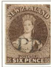
Letters PP (Paid Point to Point)