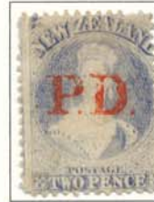
Pelure P.13 ex Burrus