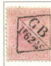
Recorded used at Opunaki, Taranaki.

For use on UNPAID mail from NZ to France