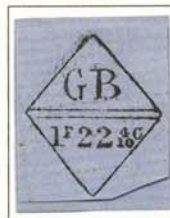
Dunedin Proof sheet