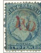
Letters PD (Paid to Destination)